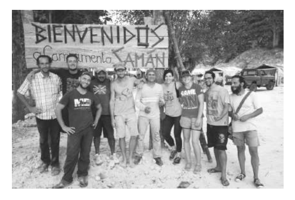
Proyecto Saman moves from its camp to build homes for families in Canoa