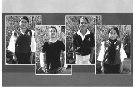
Rural youth are given the opportunity to finish high school thanks to Its About Children