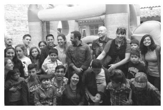
Families unite to support children with autism at ADACAPIA